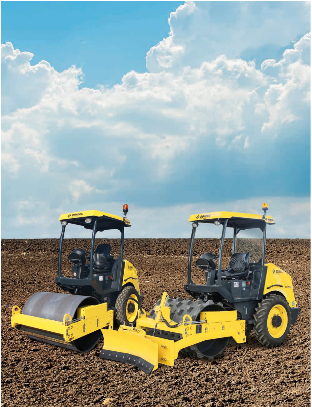
BW 124 DH-5 (smooth drum); BW 124 PDH-5 (padfoot drum).

EXTREMELY EASY TO HANDLE AND UP TO ANY TASK.